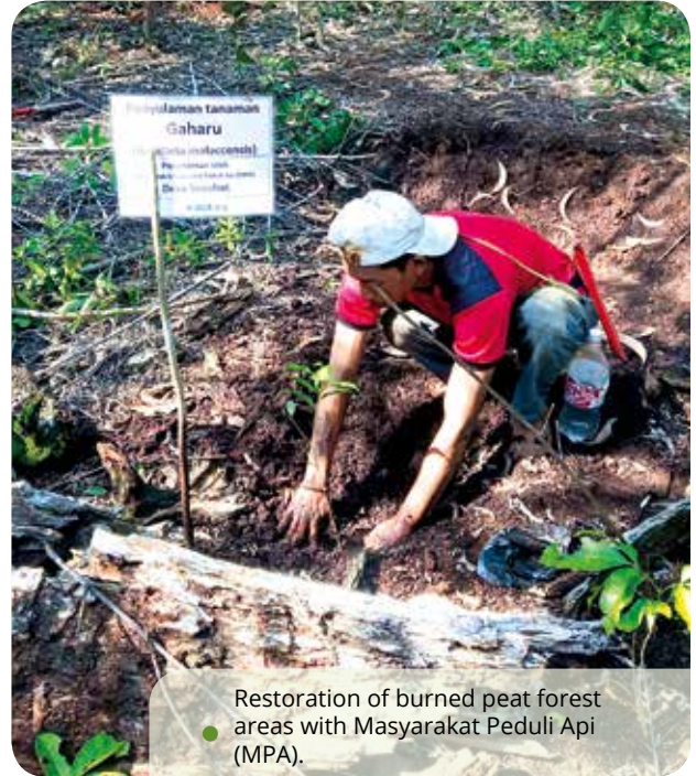
Restoration of burned peat forest areas with Masyarakat Peduli Api (MPA).

More than 200 BCA employee agents of change from 100 offices/work units throughout Indonesia.